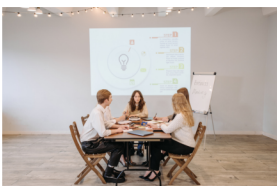
Business Meetings and Presentations