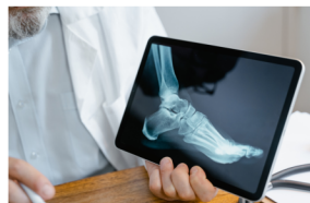
Medical Institutes and Hospitals