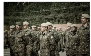
Army and defence organisation