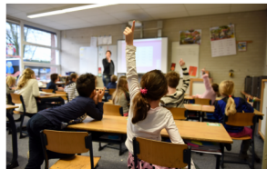
School and Universities